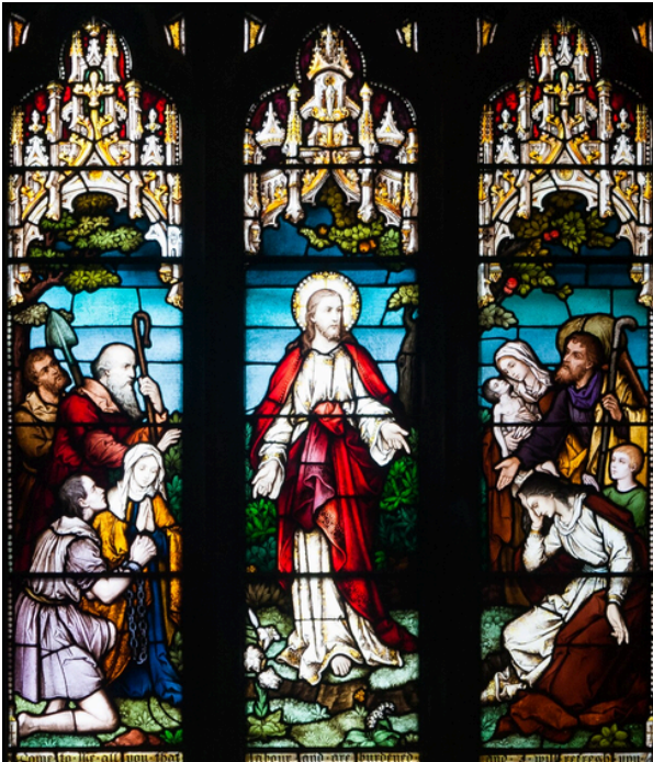
From today's Gospel: 'Come to me, all you that labour and are burdened, and I will refresh you.' Detail from St Patrick's Roman Catholic Cathedral, Armagh, Northern Ireland.

Fourteenth Sunday in Ordinary Time (Year A) Fourteenth Week in Ordinary Time