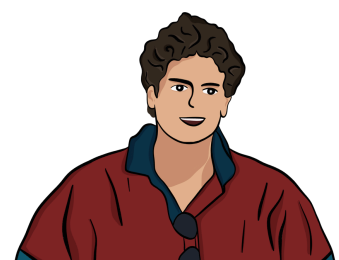
St Carlo Acutis, ora pro nobis!

The Diocesan Schools Commissioner leads the Archdiocese's Education Service to support schools and colleges and ensure that they are conducted in accordance with the teaching and disciplines of the Catholic Church. For more details and to apply before Monday 15 September, please visit tinyurl.com/bdhw4tkm .