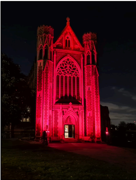
Our church lit red in support of persecuted Christians worldwide for Red Wednesday 2022.

2024 Year of Prayer • Thirty-Third Sunday in Ordinary Time (B) Thirty-Third Week in Ordinary Time • Vol. IV • Psalter Week I