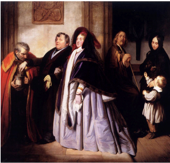
The Widow's Offering (c. 1838) by Josef Danhauser (1805–45), an artist of the Austrian Empire, is among the many artistic interpretations of this Sunday's Gospel.

2024 Year of Prayer • Thirty-Second Sunday in Ordinary Time (B) Thirty-Second Week in Ordinary Time • Vol. IV • Psalter Week IV