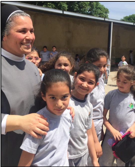
Today is World Mission Day. Our second collection is for Missio, which supports churches, hospitals, schools, and vocations in areas where the Church is new, young or poor. More details overleaf.

Twenty-Ninth Week in Ordinary Time • Vol. IV • Psalter Week I