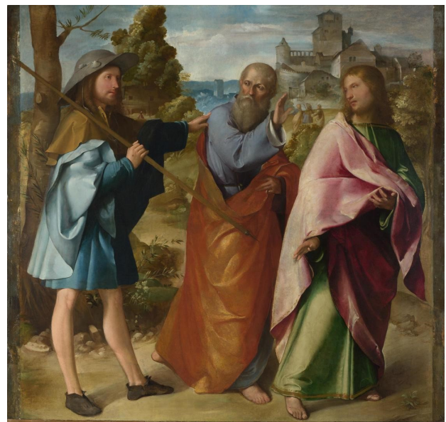
The Road to Emmaus, Altobello Melone, about 1490

Last week, it was peace and Divine Mercy: This week, the road to Emmaus, seven miles from Jerusalem. The evangelist, Luke, offers us this story to explain the mystery of our being part of Jesus which comes about through growth in new life. The disciples in the story help us to see what life in Jesus Christ really means. They told the others of their encounter with the Risen Jesus on the road to Emmaus. That encounter comes out strongly for all of us, with the other two readings emphasising the faith and moral aspects of life in Christ. Easter is a time to be seeking to share