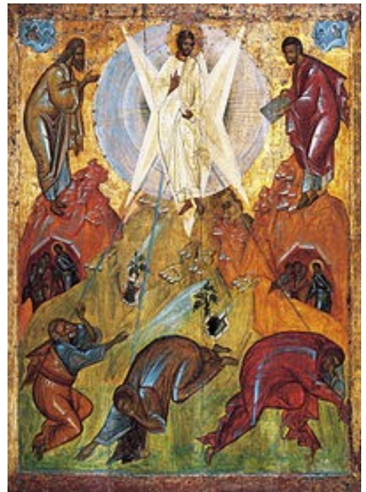
Transfiguration 15th Century

We move forward in the account of the Old Testament this Sunday, to arrive at Abraham, our Father in faith. God promises that Abraham will have great nation and be showered with blessings. This shows how much God loves Abraham, and all his children. This love is proved for us in Jesus. But this is not all. Later on the 6 th of August we will hear more. This is revealed in the account of the Transfiguration, where Jesus is seen in the glory that is respectfully his as the only Son of God. Not until after his resurrection from the dead will the disciples see this fully again, and only then will the full implications begin to unfold in their understanding and mission.